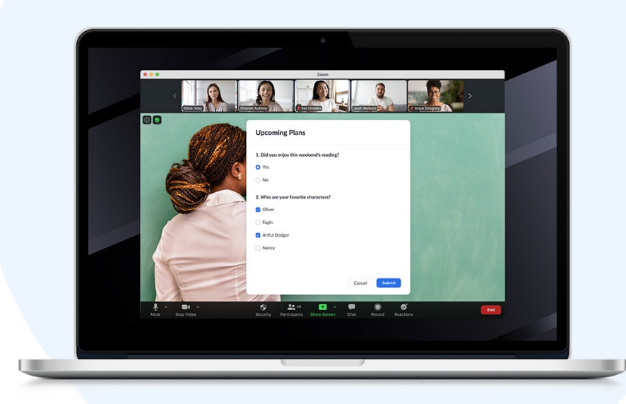
Polling and Q&A enhance collaboration

Easily create and repurpose video content into easily-digested hosted videos that allow students to learn at their own pace.